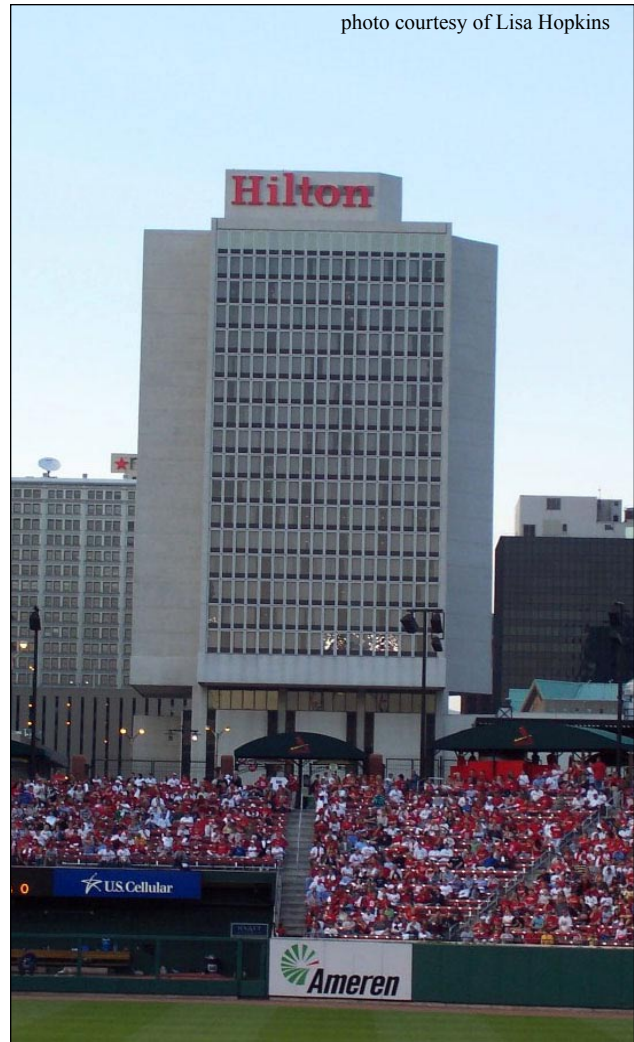
The Hilton Hotel in St. Louis overlooks the outfield at Busch Stadium and will be the site of the 2009 IALEP Conference.

The board spent much of the day touring proposed 2009 Conference venues: the Hilton, Hyatt and Millennium Hotels. Following the site visits, the board reconvened to review the proposals from each hotel. The board decided unanimously to pursue a contract with the Hilton. Ken Hailey's agency, the St. Louis Metropolitan Police, will serve as host agency. Ken presented the board with a variety of possible activities and training topics and will also have information