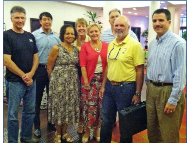
Members of the Executive Board at the Mid-Year meeting in May in Charlotte, North Carolina.